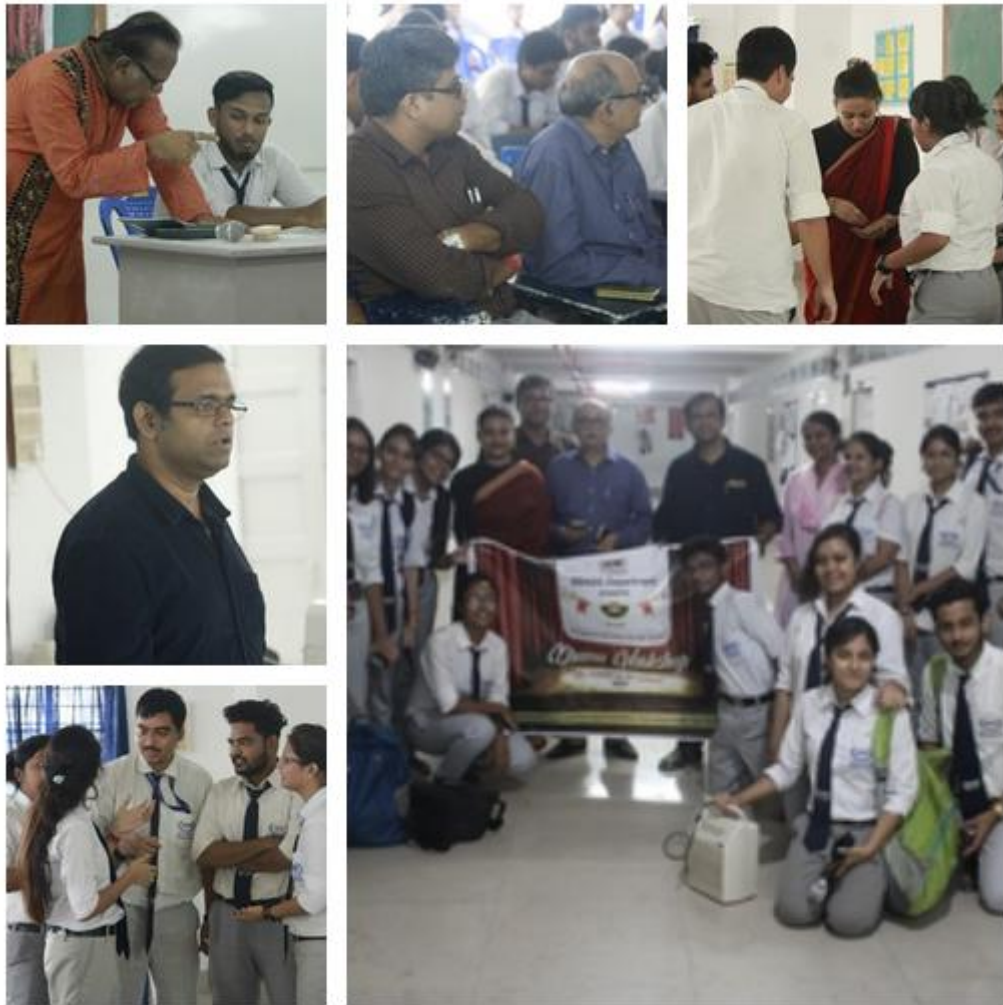
Performance during Workshop