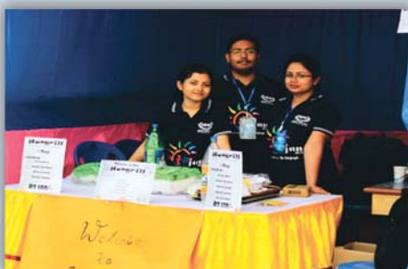
One of the food stalls given by our first year students