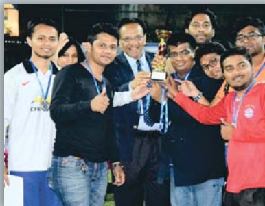
Cricket tournament iLead Runners