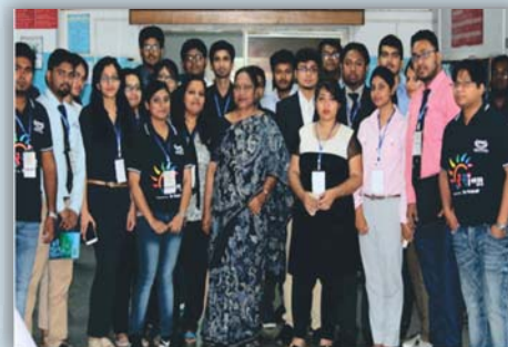
MUN – Model United Nations