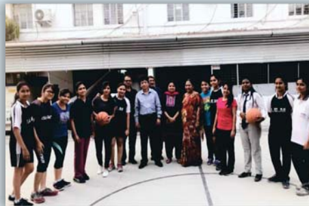
Women's Basketball Team