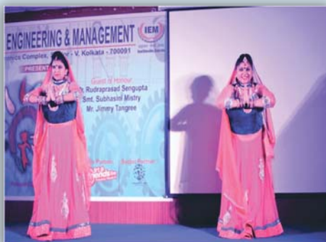
Dance program at the cultural part