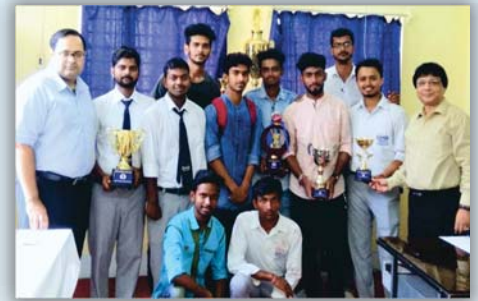
Champions With Well-Wishers