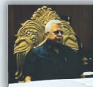
Mr. Tathagata Roy The Governor of Tripura

His Excellency Governor of Tripura Mr. Tathagata Roy was the keynote speaker in the Techno Management Fest in IEM. He stressed on the fact why India, in spite of having infrastructure, intellectual capacity, man- power etc, lagged behind other developing countries since Independence.