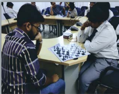
IEM Chess 2k18