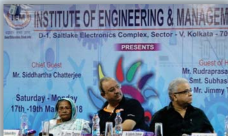
The Chief Guest and Guests of Honour – in the inaugural event of SRJAN 2K18