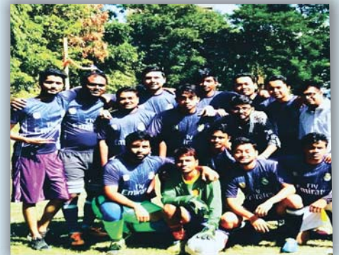
Management House Football Team