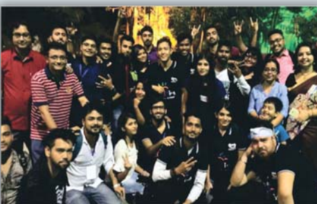
The fest comes to an end