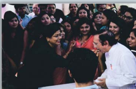
Cake cutting in the farewell party