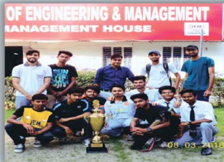
IEST Shibpur Cricket Champions