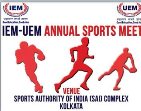
Annual Sports meet at SAI Complex